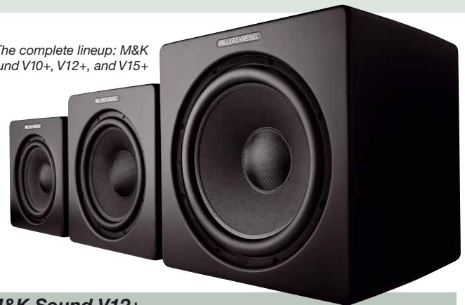
The complete lineup: M&K Sound V10+, V12+, and V15+

Professional cinema bass from a compact, living room-friendly box: The V12+ from M&K Sound is an excellent subwoofer and ideally suited for cinematic experiences in your living room. It masters powerful action movie soundtracks and high-quality music reproduction in equal measure.